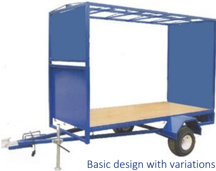
Basic design with variations