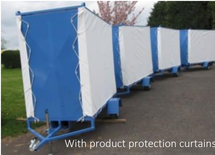
With product protection curtains